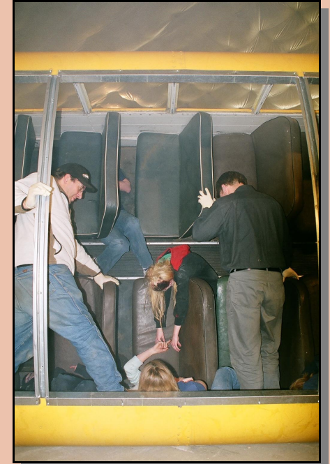
Live exercise training for school bus drivers — Pembina Hills School Division, Barrhead, Alberta.

More references—see my website at: www.kosabeck.com