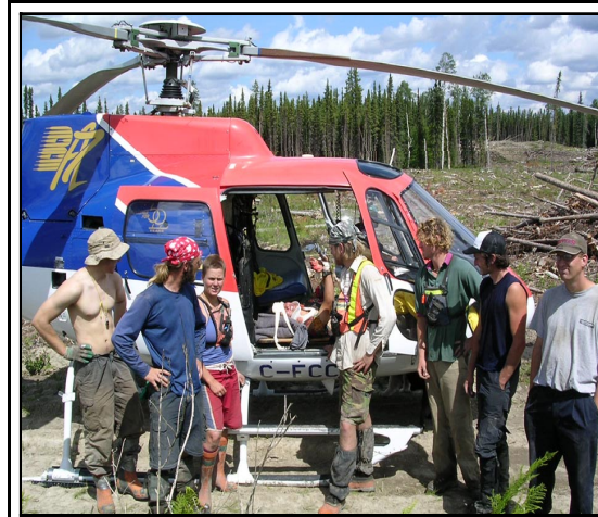
Live exercise staged with tree planters in a forestry location only accessible by helicopter. Reliable communication and well trained first aid attendants are essential. Live exercises identify the 'holes' in a company emergency response plan.