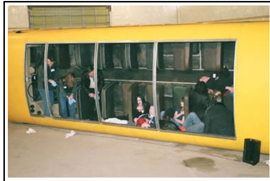
School bus modified for training . Available for group use .

A school bus modified for training purposes is available to provide 'in-bus' training for school bus drivers. Being able to stage a live exercise in an 'over-turned' school bus provides a unique opportunity for school divisions to better prepare their drivers for multi-casualty accidents.