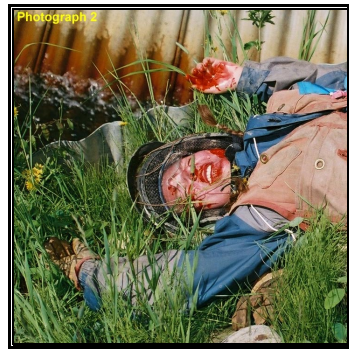
University of Alberta, field biologist live exercise training in remote areas.

Companies that have committed to annual live exercise training have experienced up to a 300% increase in first aid and emergency response performance . Employees acting as first aid attendants benefit from the practical experience of 'hands on' live exercise training. Performance reports and evaluations provide solid and useful feedback to employees participating in live exercises.