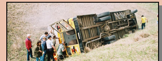
Live exercise bus accident staged in Whitecourt, Alberta. Sponsored by Northern Gateway Schools—Student Transportation Department.